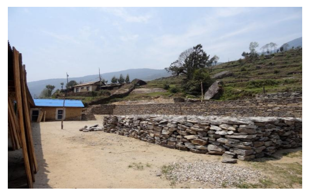
Stone for building