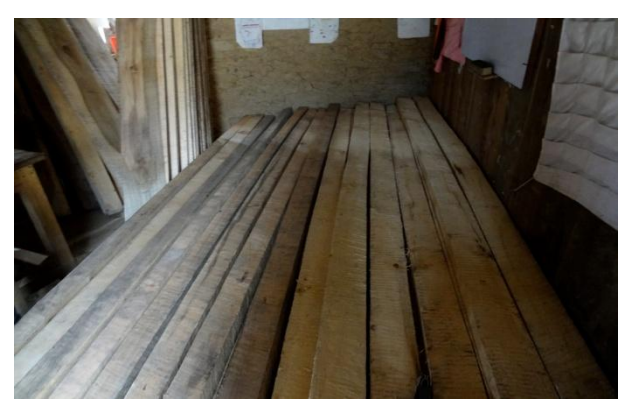
Wood for building being dried